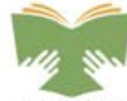
Foundation 3 Professional Learning Staff Development