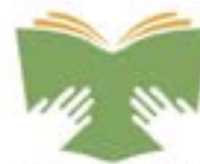
Foundation 3 Professional Learning Staff Development