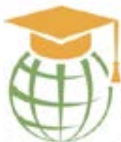
Foundation 2 Supportive Policies, Systems and Processes