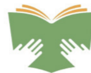
Foundation 3 Professional Learning Staff Development