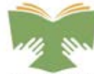
Foundation 3 Professional Learning Staff Development