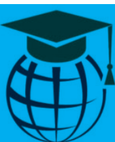
Foundation 2 Supportive Policies, Systems and Processes