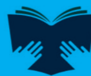
Foundation 3 Professional Learning Staff Development