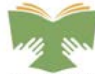
Foundation 3 Professional Learning Staff Development