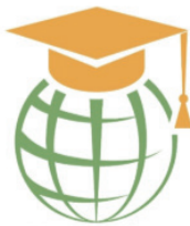
Foundation 2 Supportive Policies, Systems and Processes