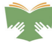
Foundation 3 Professional Learning Staff Development