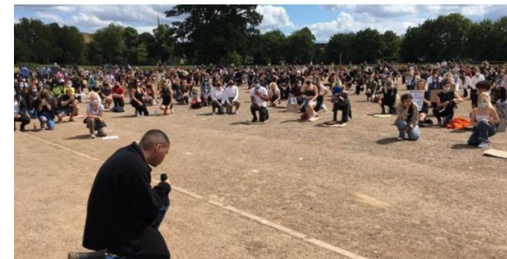
Peaceful campaigners gathering to support the Black Lives Matter campaign in Worcester

We would like to celebrate work completed by students during Character Week 2020. If you would like to, please send any photos or copies of your work to CW2020@bishopchalloner.bham.sch.uk