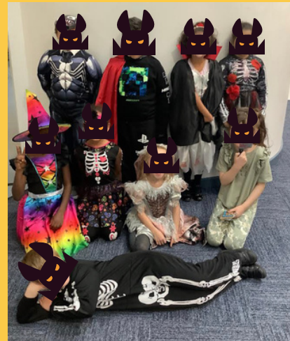
Well done to our best dressed winners.