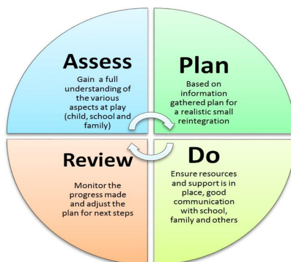
Figure 2: Assess, Plan, Do and Review Cycle (APDR)

At Aspire Academy we follow the Assess-Plan-Do Review cycle to monitor the impact of interventions, helping our staff to develop a growing understanding of pupil’s needs and effective ways to support pupils with SEND.