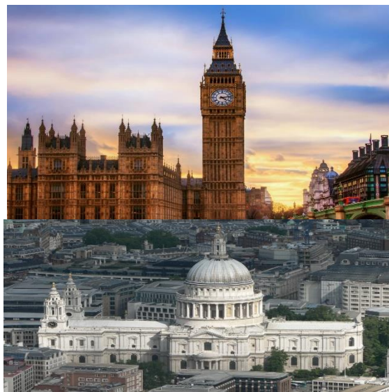
Houses of Parliament and Big Ben