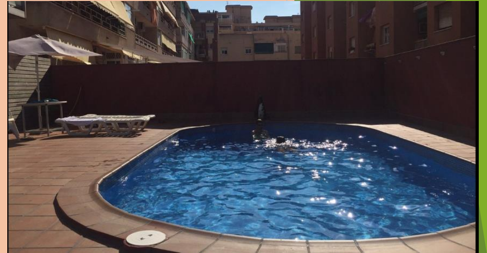
Hotel Flora Parc

If you're looking for something to do, Castillo de Castelldefels (0.4 mi) is a nice way to spend some time, and it is within walking distance of Hotel Flora Parc.