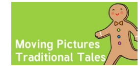
Moving Pictures Traditional Tales