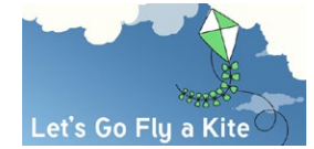
Let's Go Fly a Kite