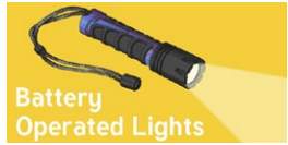
Battery Operated Lights