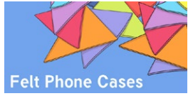
Felt Phone Cases