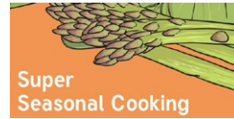
Super Seasonal Cooking