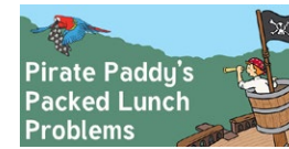
Pirate Paddy's Packed Lunch Problems