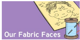
Our Fabric Faces