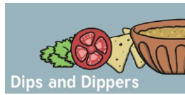
Dips and Dippers