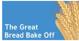
The Great Bread Bake Off