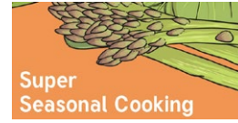
Super Seasonal Cooking