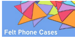
Felt Phone Cases