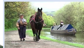
Canal boat pulled by horses