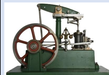
A steam engine