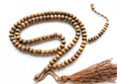
Islamic prayer beads