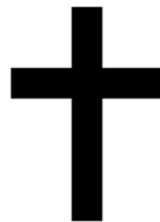
The sign of Christianity