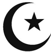
The sign of Islam