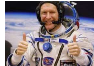
Sir Tim Peake.