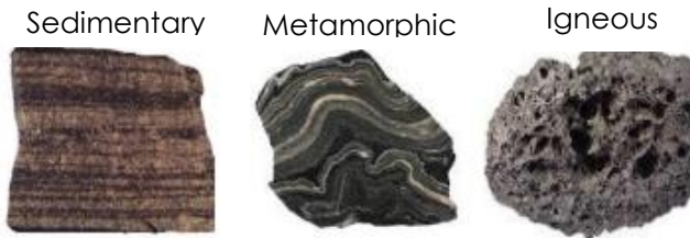
This diagram shows how rocks are formed: