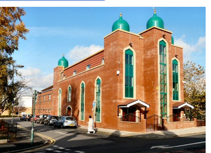
Jamia Mosque - Hyde