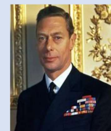
King George VI