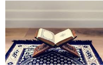
The Holy Quran