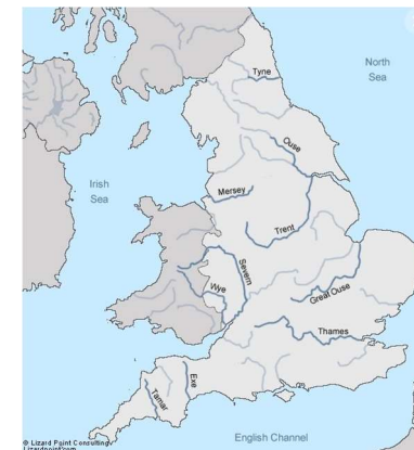
Map of local rivers around Tameside