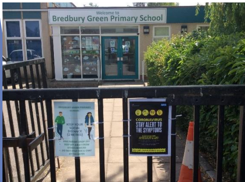
Staff car park entrance gate - Key Workers