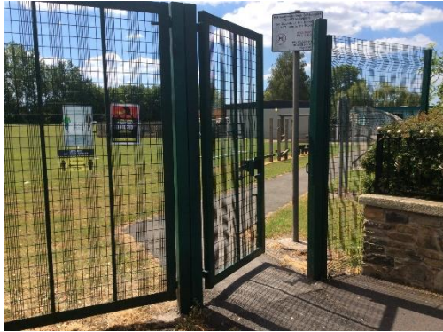
Ormerod Close entrance - Nursery and Reception