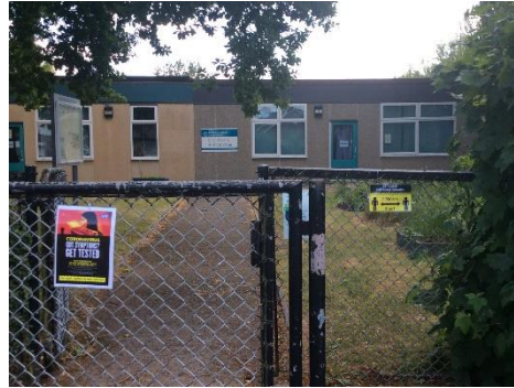
Clapgate pedestrian entrance - Year 6