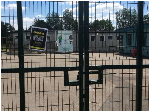
Staff car park side gate - Year 1