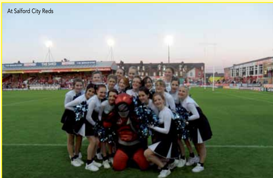
At Salford City Reds

The cheerleaders even took a prime guest spot supporting the Salford Reds Rugby League Club and we are sure that they will continue to further success!