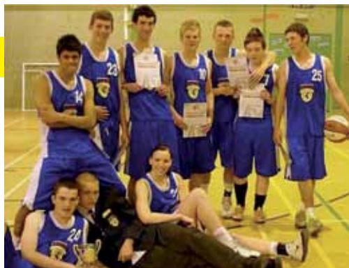
U16 Basketball champions.