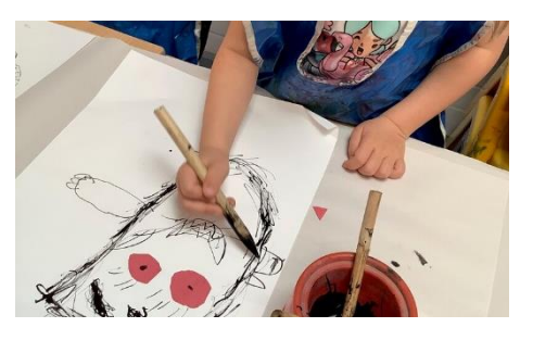
Inky BEASTS - Year One