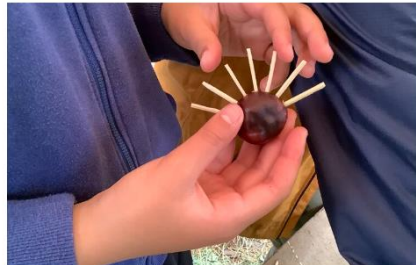
Year 6 Forest School Term 1 2023