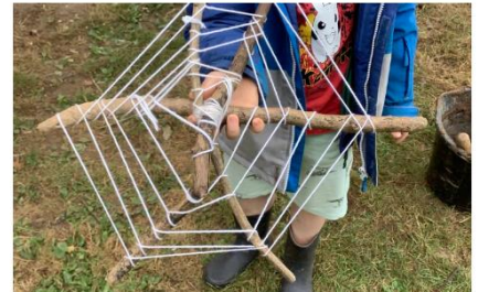
Forest School Year 3 Term 1 2023