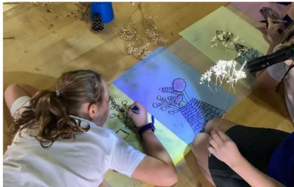
Creative Folkestone Art Workshop - Still life