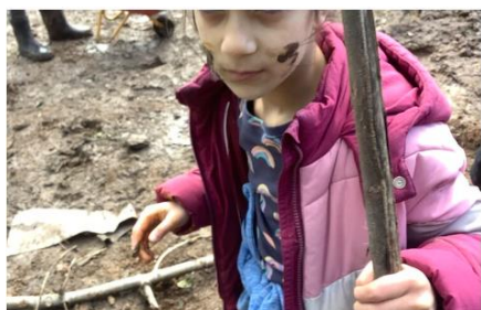
Forest School Year 3 Term 4 2024

The best way to keep up to date with what is happening at school is via the school blog .