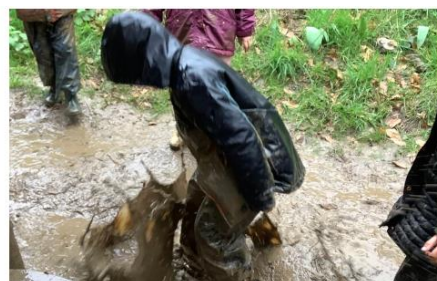
Year 1 Forest School Term 5 2024