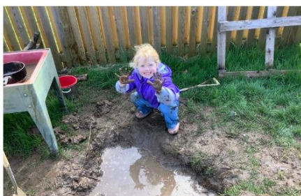
Forest School Year R Term 4 2024