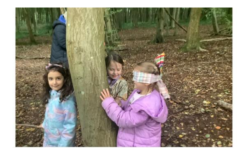
Woodland trip to Covert woods Year 1 October 2024