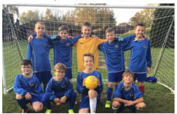
Stunning Performance from Bridge B Team!