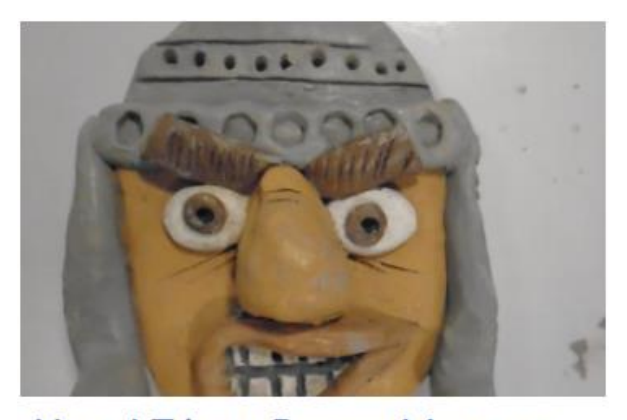
Year 4 Trip to Roman Museum