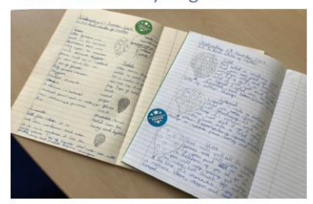
What's the Matter?