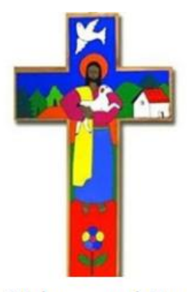
Christian Values and Prayer

Each week in the newsletter, we will be highlighting new blog posts from our school website. Clicking on these links will take you directly to the blog post where you can read it in full and comment if you so wish.