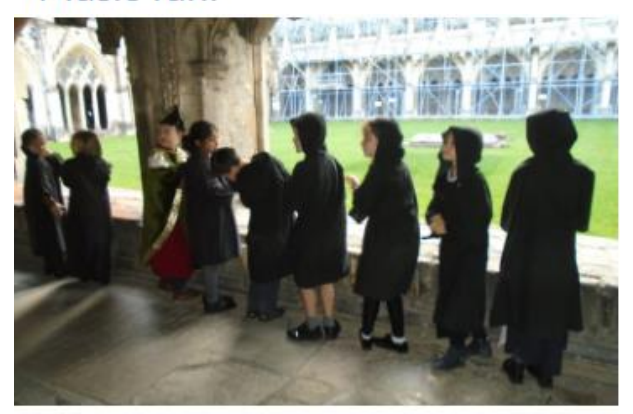
Year 3 Pilgrims