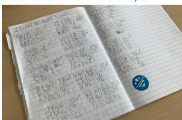
Maths in 2RF