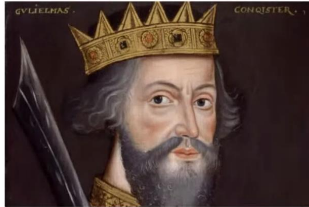
William, Duke of Normandy

The topic activity for this week is History - all about The Norman Conquest of England. There are some great resources on the internet on sites such as; https://classroom.thenationalacademy/lessons/norman-conquest-lesson-1/activities/1 https://www.bbc.co.uk/search?filter=bitesize&scope=bitesize&q=norman+conquest