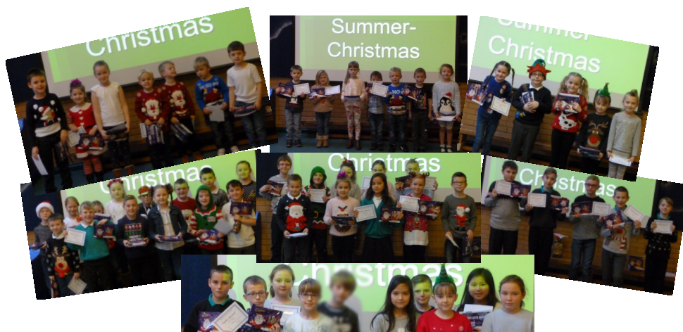
Well done to all the pupils who achieved 100% attendance for the Autumn Term