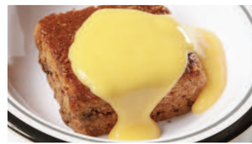
Sticky Toffee Pudding served with Custard