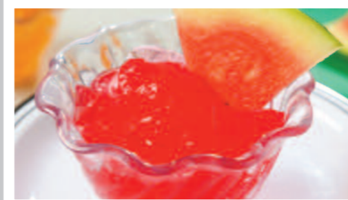
Jelly & Fruit