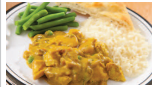
Chinese Chicken Curry served with Rice, Naan Bread & Seasonal Vegetables