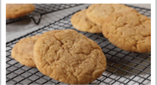
Snicker Doodle Biscuit

AVAILABLE DAILY – UNLIMITED SALAD, FRESHLY BAKED BREAD, FRUIT YOGHURT, FRESH FRUIT PLATTER & CHILLED WATER. FOR ALLERGEN INFORMATION, PLEASE ASK ONE OF OUR CATERING TEAM. ALL THE ABOVE DISHES ARE SUBJECT TO AVAILABILITY.