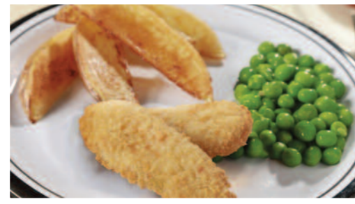
Breaded Chicken Goujons served with Potato Wedges & Seasonal Vegetables