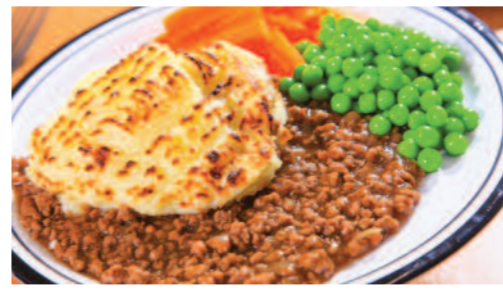
Cottage Pie served with Seasonal Vegetables