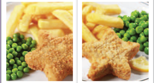
Salmon/Cod Fish Star (MSC) served with Chips & Peas or Baked Beans

VEGETARIAN VERSIONS OF THE ABOVE MEAL AVAILABLE DAILY