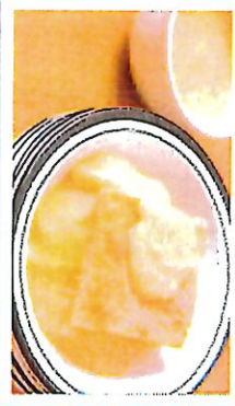
Apple Pie & Custard