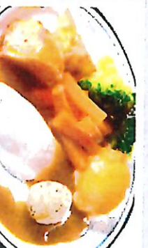
Roast Chicken served with Roast/Washed Potatoes, Seasonal Vegetables & Gravy