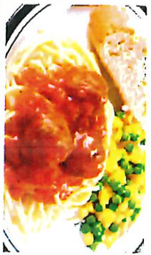
Meatballs in Tomato Sauce served with Spaghetti, Garlic & Herb Bread and Seasonal Vegetables