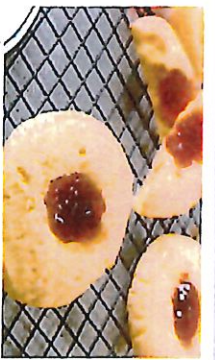
Jam & Custard Biscuit