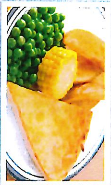
Cheese & Tomato Pizza, served with Potato Wedges & Seasonal Vegetables