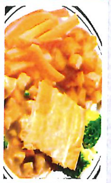
Homemade Chicken Pie served with Diced Crispy Potatoes & Seasonal Vegetables