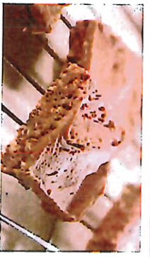
Iced Chocolate Oaty Square