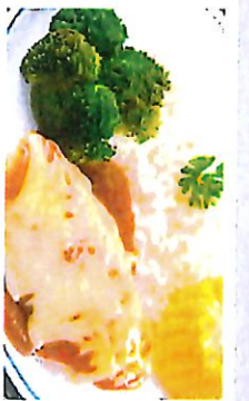
BBQ Chicken served with Savoury Rice and Seasonal Vegetables