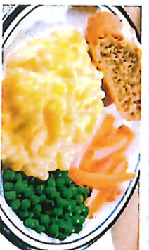
Mac 'n' Cheese served with Garlic & Herb Bread and Seasonal Vegetables