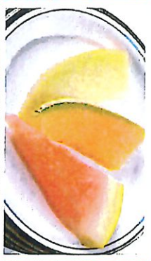
Trio of Melon