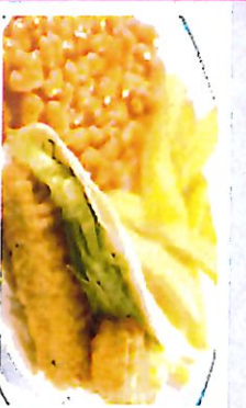
Fish Finger (MSC) Taco served with Chips & Peas or Baked Beans