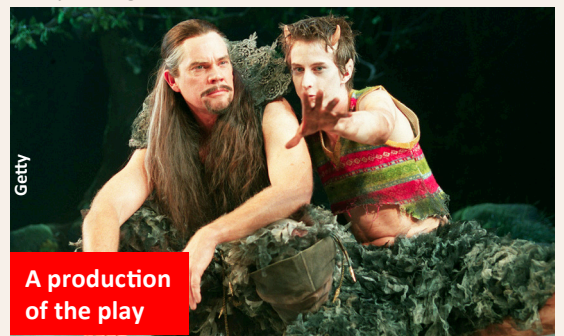
A production of the play

Epic Games, the creator of Fortnite , has teamed up with the Royal Shakespeare Company to make a game out of the play A Midsummer Night's Dream . It will be playable online and Epic says it will be "a new type of storytelling".