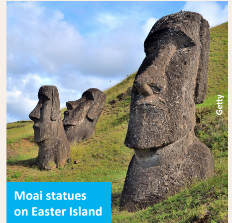
Moai statues on Easter Island