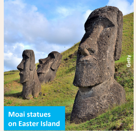
Moai statues on Easter Island