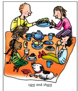
3. c<u>are,</u> sh<u>are,</u> d<u>are,</u> b<u>are,</u> sp<u>are,</u> sc<u>are,</u> fl<u>are,</u> squ<u>are,</u> Cl<u>are,</u> softw<u>are</u>