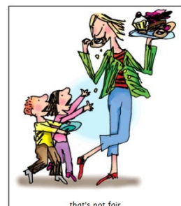
2. <u>fair</u>, st<u>air</u>, h<u>air</u>, <u>air</u>, l<u>air</u>, ch<u>air</u>

door, poor, moor, floor, poorly, indoors, doorway, moorhens