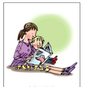
2. t<u>oo</u>k, l<u>oo</u>k, b<u>oo</u>k, sh<u>oo</u>k, c<u>oo</u>k, <u>foo</u>t