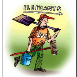
t<u>oo</u>, z<u>oo</u>, m<u>oo</u>d, <u>foo</u>l, p<u>oo</u>l, st<u>oo</u>l, m<u>oo</u>n,