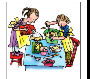
make, shake, cake, name, same, game, save, brave, late, date