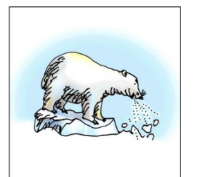
2. bl<u>ow, snow, slow, show, know, flow, glow</u>