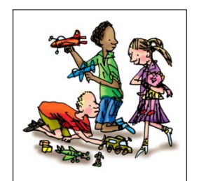
. day, play, may, way, lay, say, tray, spray