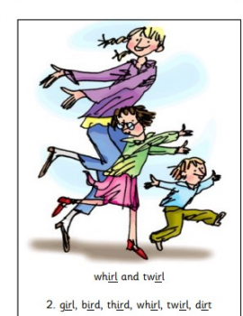
shout it out

door, poor, moor, floor, poorly, indoors, doorway, moorhens