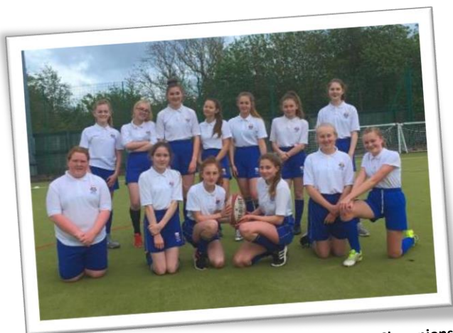
U 13's Girls West Lancashire Schools Touch Rugby Champions

We have seen some fantastic sporting achievements this school year.