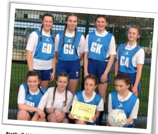
Netball U13's West Lancashire schools district Champions