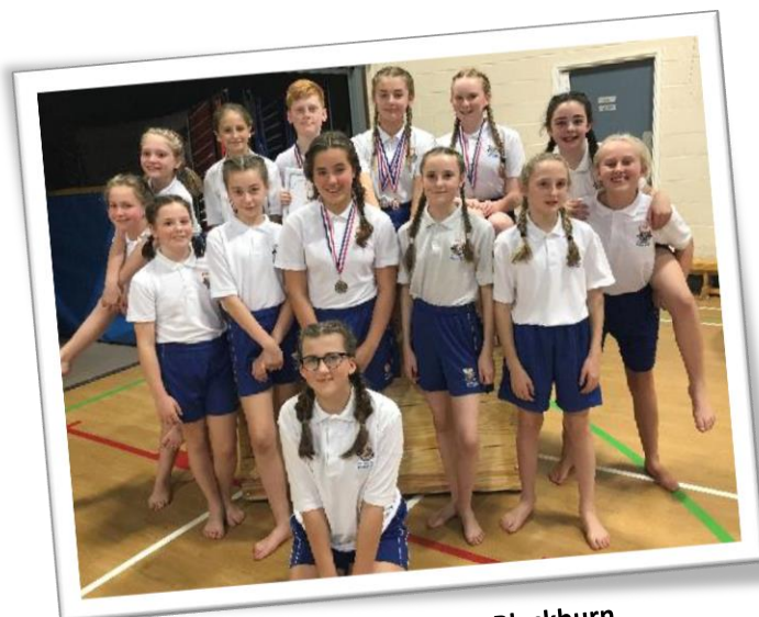
Gymnastics Success in Blackburn