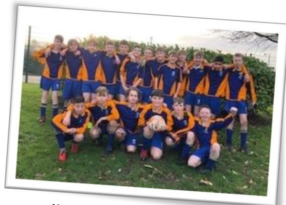
Year 8 Boys Football Runners-Up