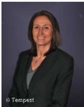
Assistant Headteacher School Culture