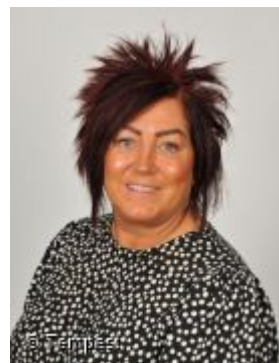
Safeguarding & Wellbeing Manager