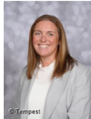
Head of Year 7