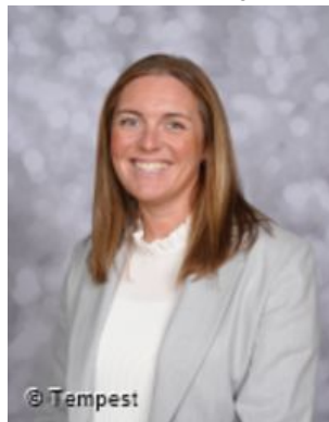
Head of Year 7