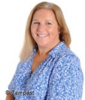
Head of Learning Support