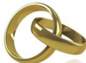
Marriage / Civil Partnership