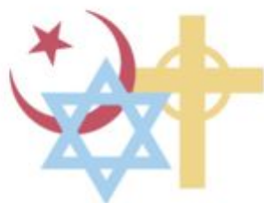
Religion / Belief