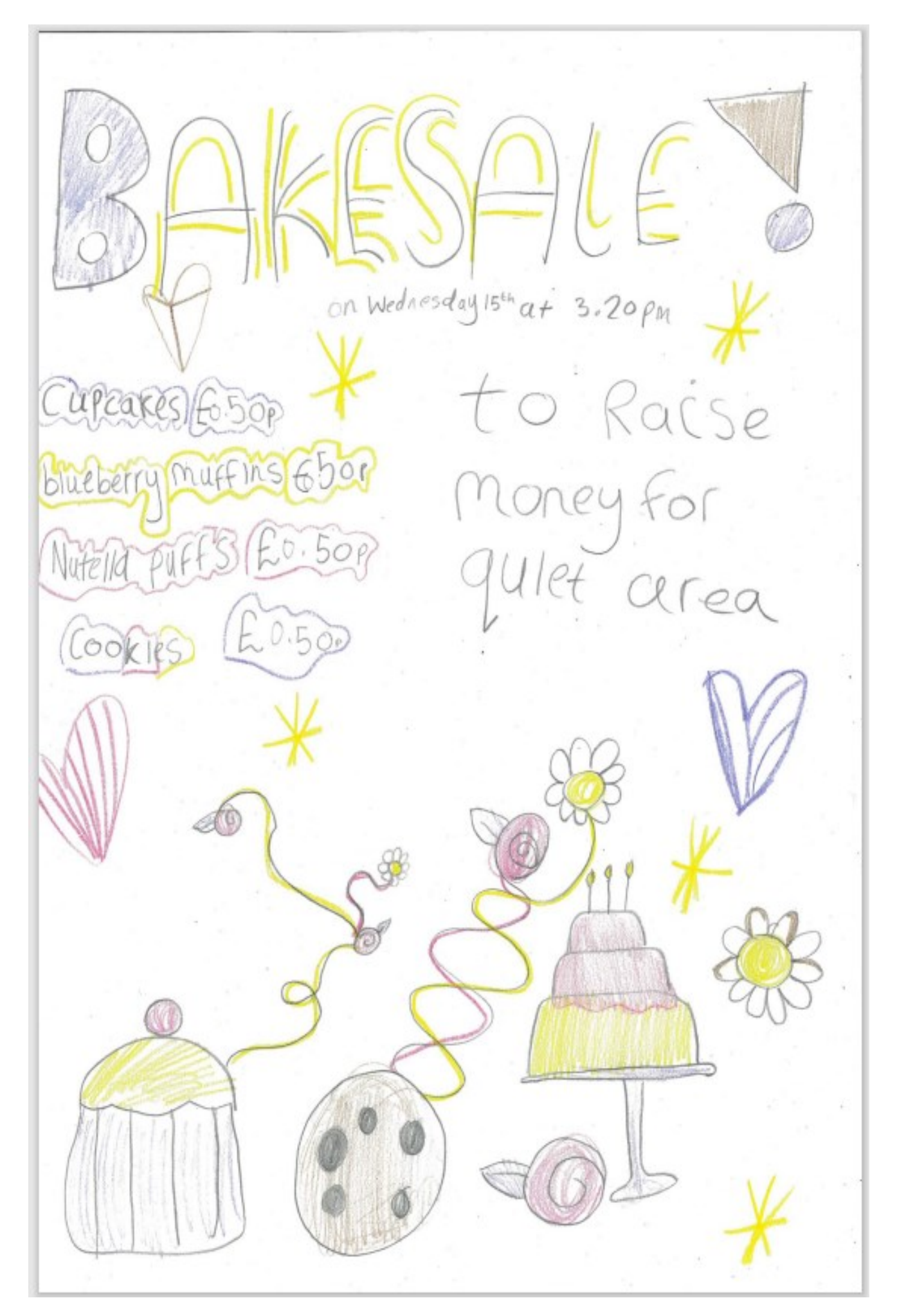
friendship, care and trust