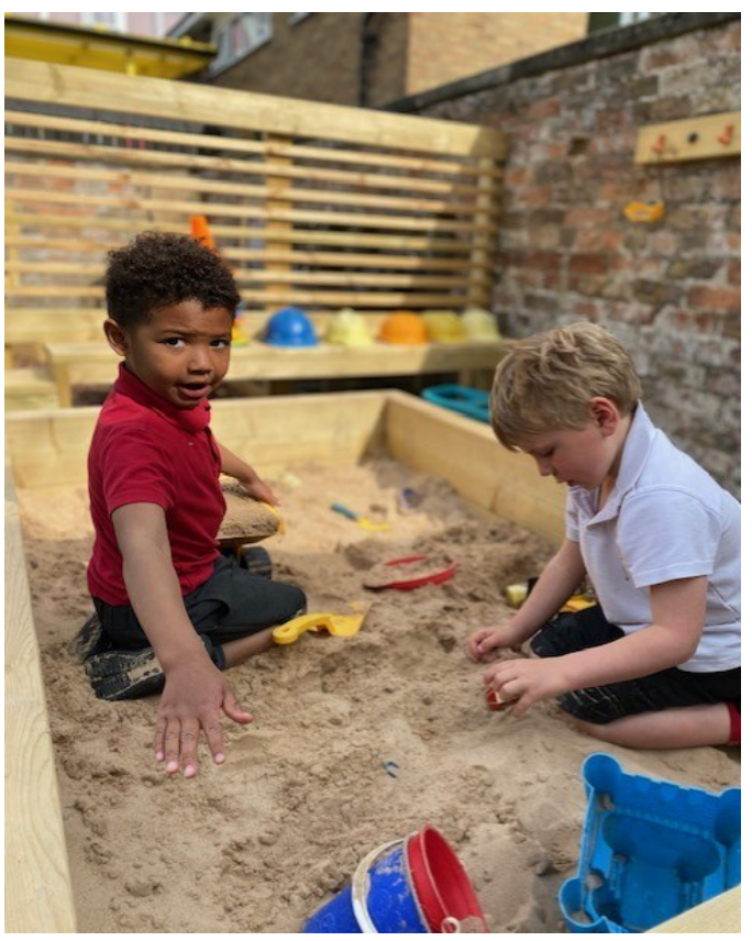
friendship, care and trust