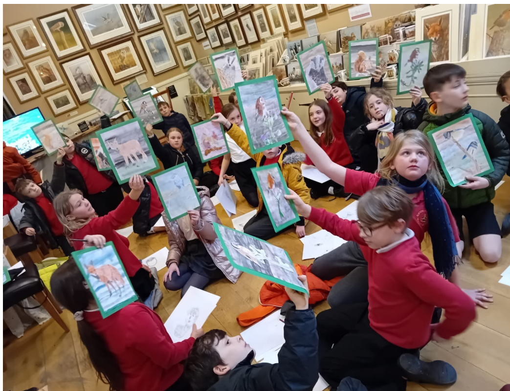
friendship, care and trust