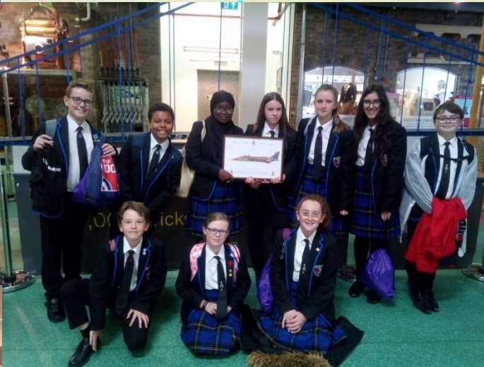
The amazing students on the left won every single challenge out of the three they entered at the Full STEAM Ahead event for local schools! Well done all!