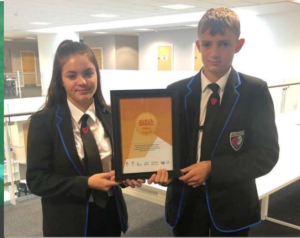
Burton Borough School received the Gold Award from School Games! Well done to everyone involved and to our PE department!