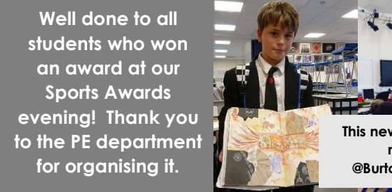
Well done to all students who won an award at our Sports Awards evening! Thank you to the PE department for organising it.

Burton Borough School Audley Avenue, Newport, Shropshire TF10 7DS Website: www.burtonborough.org.uk Tel: 01952 386500 This newsletter only contains a selection of photos and news so make sure you follow us on Twitter and Instagram @BurtonBorough for daily updates, more photos and videos!