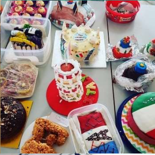
We celebrated the European Day of Languages with a bake sale organised by the MFL department. Over £90 was raised for charity!