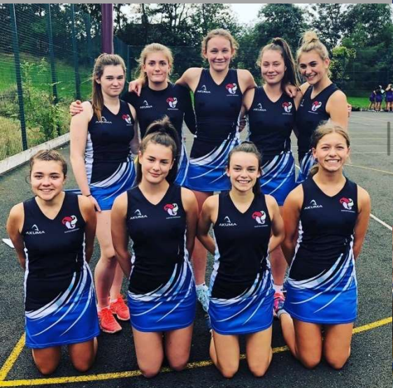
These students (above) won every game at the TWSSA 6 th form netball tournament, despite being in year 10 and 11! WOW!