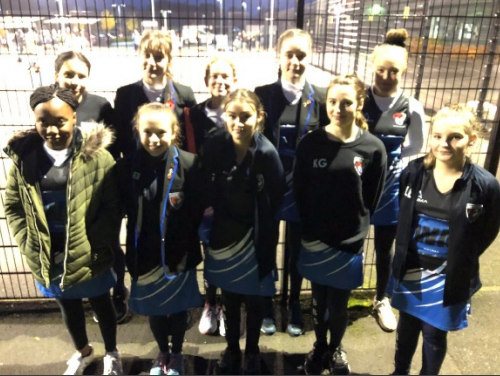
Both the year 7 and 8 Diamond netball teams have qualified for the premiership league for the Winter Netball League! Well done!