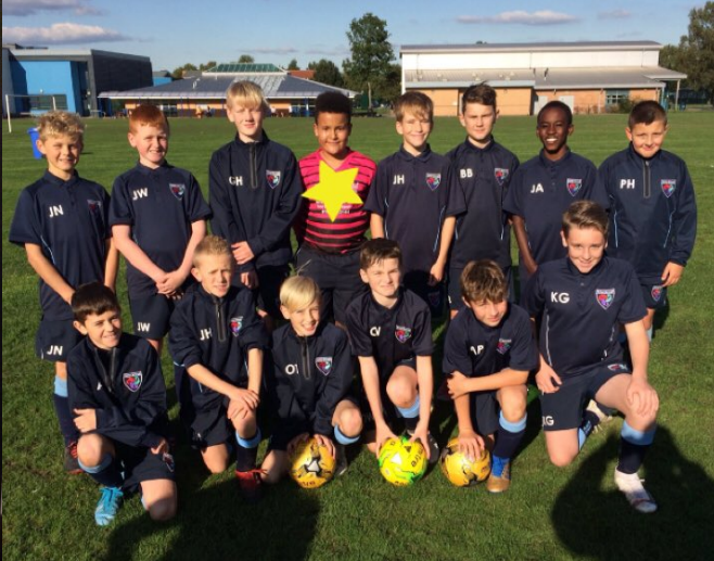
Year 7s have settled in well and are playing some fantastic football!