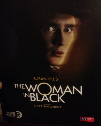
Year 10 and 11 watched Woman in Black at the Regent Theatre in Stoke. It was a rather spooky play that made some of our students scream!