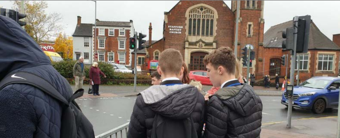
Students conducted geography fieldwork in Stafford