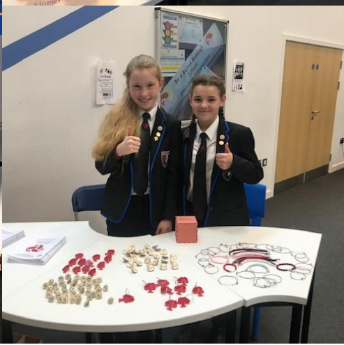
April was a month of celebration, with award assemblies and celebration evenings for each small school. Well done to everyone who received an award! You have all worked incredibly hard and those certificates and trophies are VERY well-deserved!