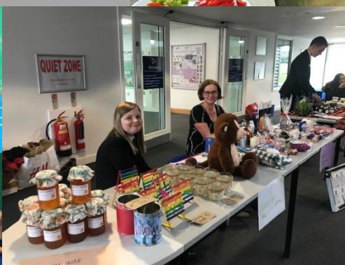
More photos and information about our celebration evenings to come in our Small School newsletter!