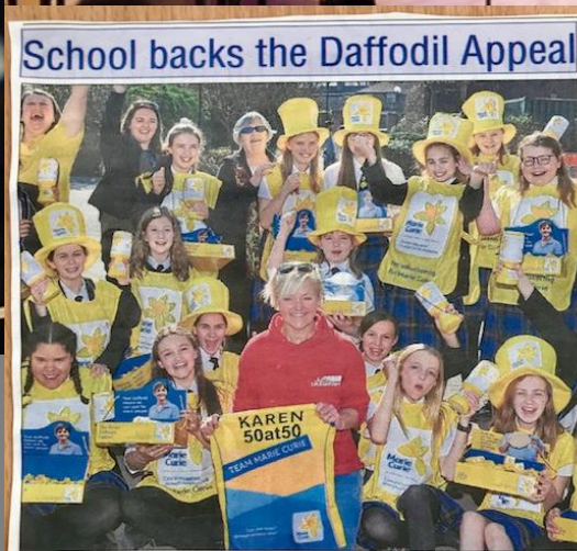
The team from Burton Borough collecting for Marie Curie's Daffodil Appeal

Our wellbeing mentors had training in April and we are delighted to have new members on the team!