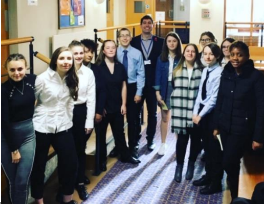
Some of our students went to Stafford University for a bar mock trial against other schools! They did extremely well!