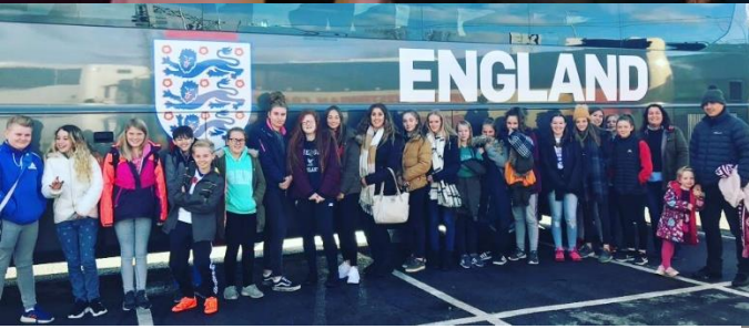
Our girls went to see the England Lionesses play! A great day had by all, despite the result!