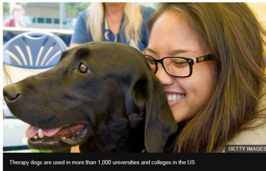
Therapy dogs are used in more than 1,000 universities and colleges in the US

Stress among students really can be reduced by spending time with animals, according to research from the US.