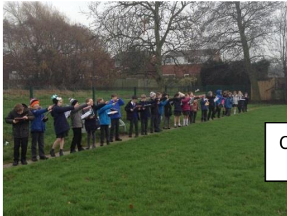
Owls' Class work