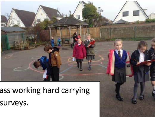
Doves' Class working hard carrying out their surveys.