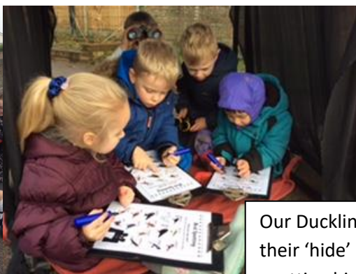
Our Duckling's in their 'hide' spotting birdlife.