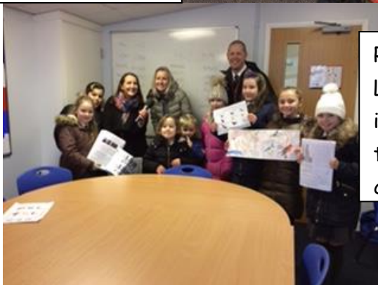
Radio Lancashire interviewing the children