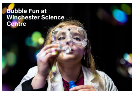
Bubble Fun at Winchester Science Centre

There are lots of longer-term activities going on locally during the summer break this year. Here is a great selection to suit every taste!