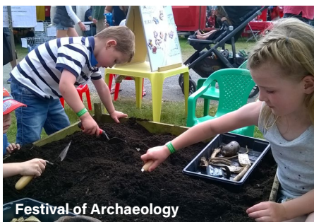
Festival of Archaeology

Step into the world of Chitty Chitty Bang Bang with this extraordinary new exhibition, celebrating Ian Fleming's iconic tale like never before. See over 80 original illustrations, including, for the very first time, the complete set by legendary artist John Burningham, created 60 years ago. 11am-4pm nationaltrust.org.uk/visit/hampshire/mottisfont