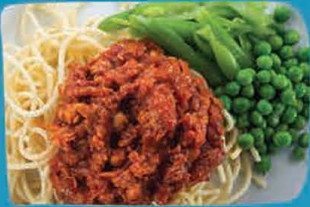
Chicken Katsu curry and rice