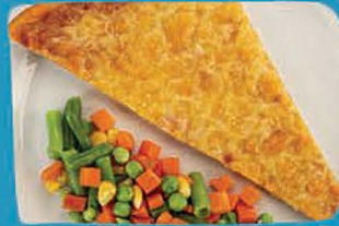
Sweet sticky chicken with rice