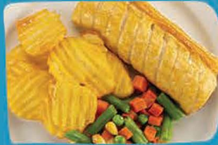
Ham carbonara with pasta