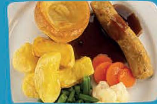
Sliced beef and Yorkshire pudding