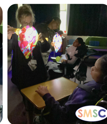
In S1 one we have been going on sensory journeys on a hot air balloon, exploring weather and habitats in different countries.