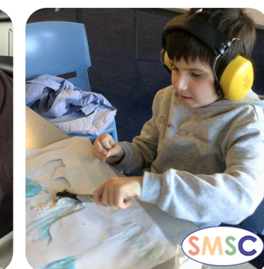
S2 have been thinking about the Antarctic – we have explored ice, made a junk model and thought about animals and birds which we might see there.