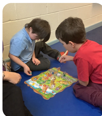
We have been playing together and building friendships in class. Turn-taking and cooperation really helps our social skills!