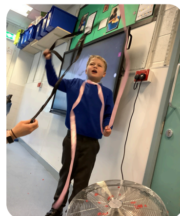
P3 and P4 have been demonstrating realisation for recycling, using litter pickers and sorting between paper and plastic!