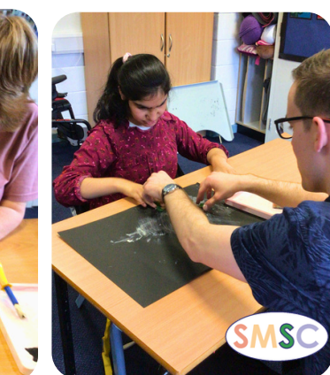
This half term in Secondary 4 we have explored sensory activities linked to the cold snowy weather, including multimedia mark making snow scenes.