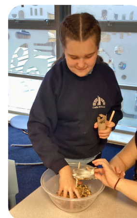
This term S3 have been thinking about the climate and how we can help. We made birdfeeders with recycled materials to place in the community.