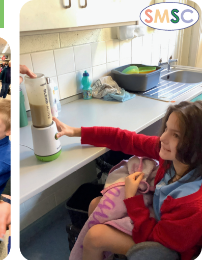
P5 enjoys our 'snack chefs' lessons. We buy our ingredients from the supermarket on Tuesdays and then prepare our delicious snacks on Wednesday mornings. It really helps our skills for independence.