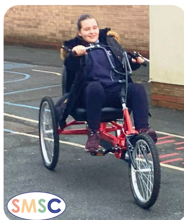
This half term S3 have enjoyed the most of the beautiful weather, learning about keeping our bodies healthy by doing our daily exercise outside.