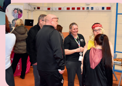
It was great to see so many parents of our older students at our Coffee and Cake morning. It was a fantastic opportunity to meet a wide range of providers from day centres to the Social Care and Medical transition teams. We look forward to going even bigger next year!