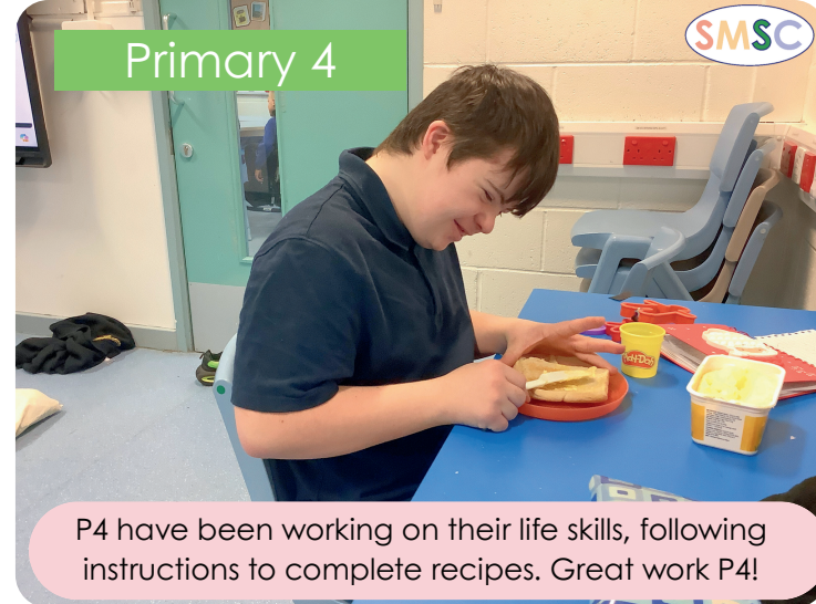
P4 have been working on their life skills, following instructions to complete recipes. Great work P4!