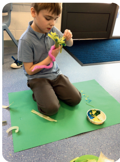
P3 have been developing their confidence exploring foods in increasingly complex ways with initial modelling. Well done P3!