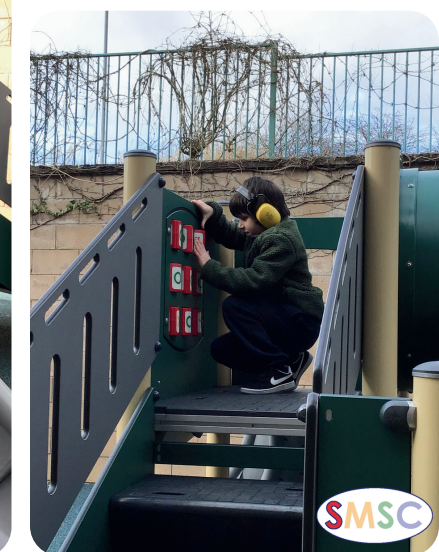
S2 have been making the most of the dry days by exploring the playgrounds around school.