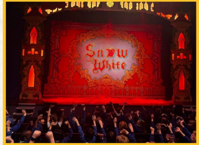
YEAR 1 TO 6 - ROYAL & DERNGATE