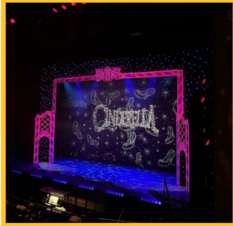
YEAR 7 - MK THEATRE